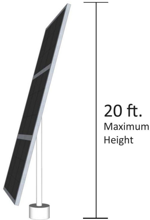
Ground-Mounted Collector Example